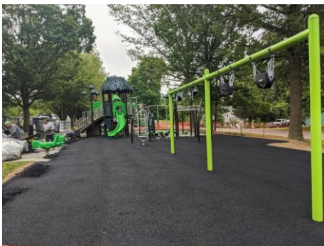
First layer of safety surface being poured.