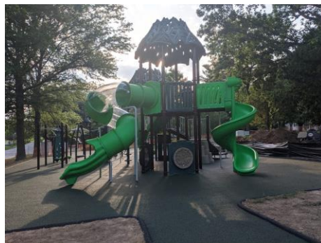
Photo after the safety surface was installed.